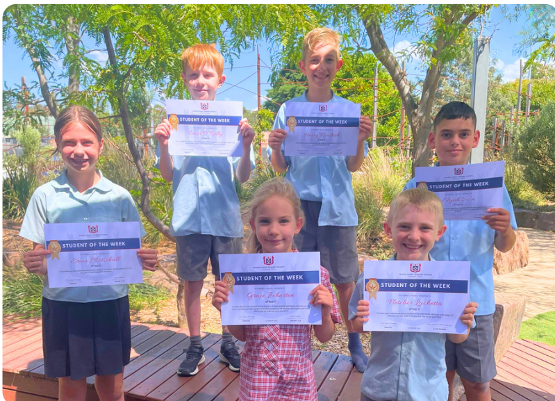
Our Week 2 'Student of the Week' Award recipients with their certificates