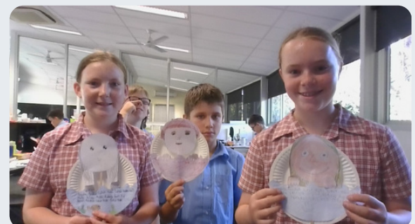
Students with their song lyrics on their craft projects!