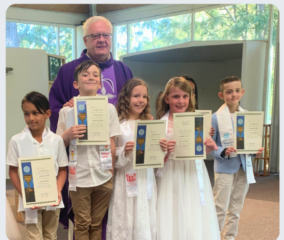
Previous year's proud Eucharist Candidates

Sunday 17 March, 9am 📍 Sacred Heart Church Attendance required