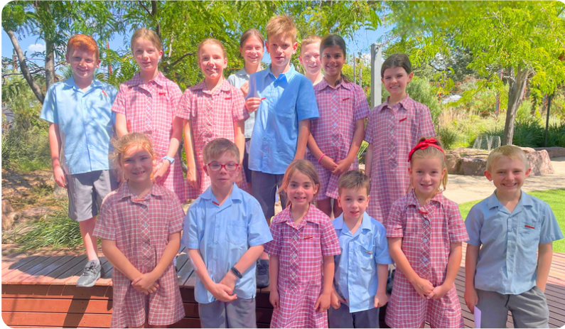
Junior School for Term 1

These students proudly received their badges at Assembly last Monday.