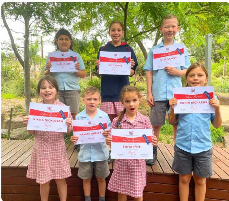
Our Week 1 Value Award recipients with their certificates