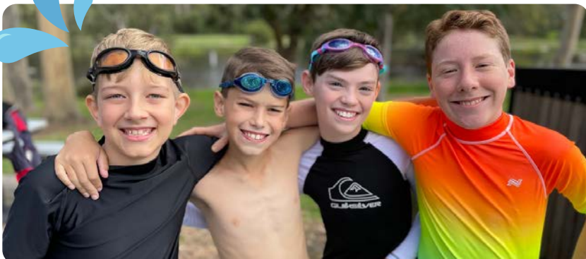
Some of our qualifying students!